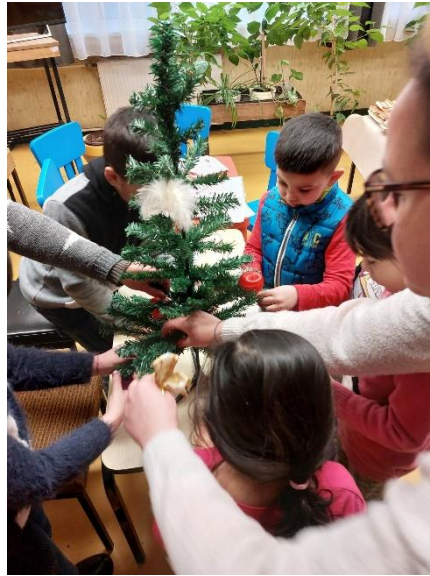
Christmas celebration, Gyöngyös