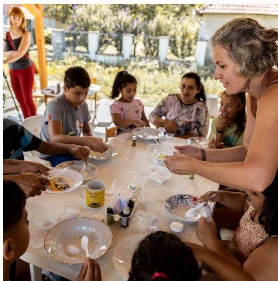
Playing for change session, Bükkszentmárton