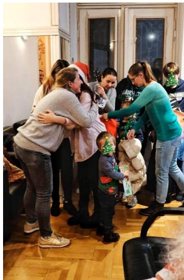
Ukrainian Christmas in Budapest

Under the name Ukrainian Christmas 2022 , at the end of the year, our volunteers started an individual collection and collected nearly 500,000 HUF donations, which were supplemented with material donations, and presented nearly 100 Ukrainian families with gifts in a festive atmosphere before the Christmas holidays.