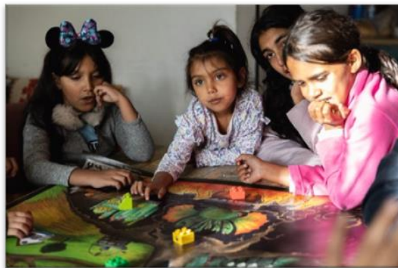
Children’s session, Szomolya

More information: https://karpatokalapitvany.hu/en/earthismyfriend