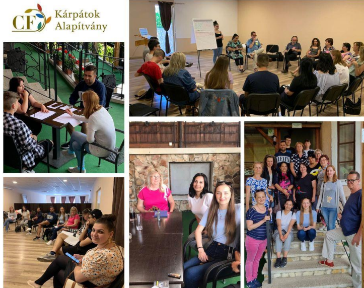
Community Leader Training, Eger