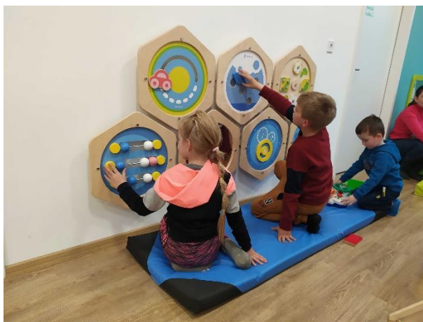
Hidden Trasures Down Association, Nyíregyháza

In 2022, we received a total of 21 applications, and the Foundation's Board of Trustees supported a total of 12 projects for HUF 17,919,027. The programmes organised were mainly targeted at refugee families, with some projects focusing on children, families with disabilities, children with disabilities, while others focused on volunteers working at the border, host families or people in need of medical care.