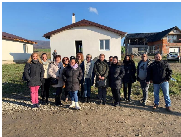
Best practice visit, Slovakia

The main sponsor of our programme, which has been running for more than five years, has announced that it will end its support at the end of 2024 and will withdraw its educational programmes from the region. We are therefore working with our local partners to close, continue, and sustain the programme. In January 2023, our Board of Trustees awarded them final grants for this purpose, with a total of 6 organisations receiving grants totalling HUF 10 million.