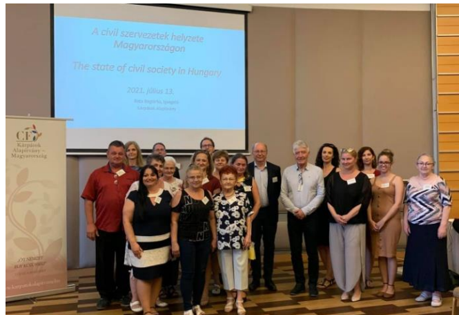
13 July 2021 The situation of NGOs in Hungary conference

The four events were attended by more than 150 participants, and 10 good practices were shared between Hungarian, Ukrainian, Slovak, and Polish NGOs. The participants were very active and had many questions and comments on the good practices presented. Interpretation in four languages enabled communication between participants from different countries.