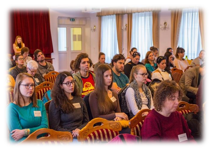
Picture 2. Conference entitled "Strengthening and activating small communities of Northeast Hungary".

On November 21, 2019, we also held a professional conference, a regional professional meeting for representatives of operating the CSOs in Northeast-Hungarian region. Nearly 80 people attended the event. The purpose of the event was to create a meeting place for CSOs organisations operating in the region, promoting their cooperation facilitating the sharing of their experiences.